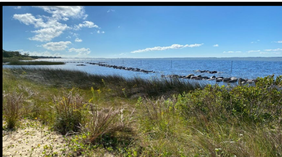
Living Shoreline (REPI)