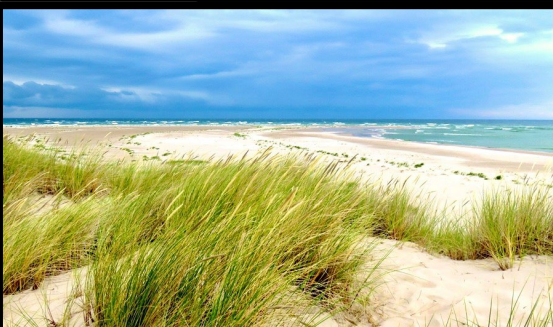
Coastal Dune Restoration (USFWS)