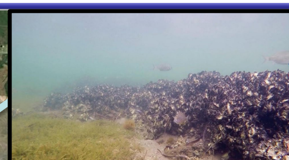
Oyster Reef (REPI)