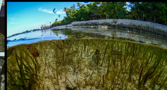
Seagrass Enhancement (RESTORE)